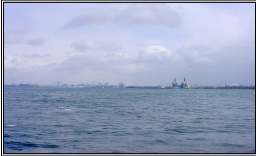
Figure 13: Simulation view of project from Dr. Henry Belanger Park