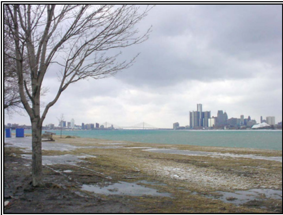
Figure 9: Simulation view of the project from Belle Isle Park

The significance of the impact of the new span would be considered “low” given the expanse of the view, distance of the island from the new bridge and the location of the new bridge behind the existing one. The aesthetic quality of the view would continue to be considered “good”. The new span will be similar thematically and provide a new signature silhouette demonstrating Detroit’s commitment to continuing to improve the city for the future (Figure 9).