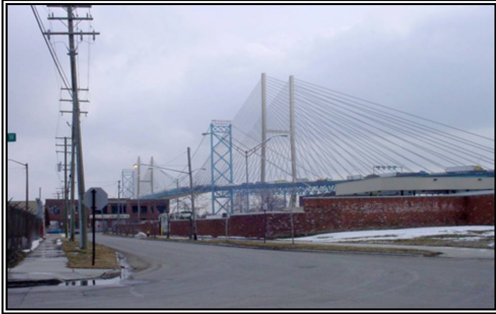
Figure 3: Simulation view of project from St. Anne's Cathedral