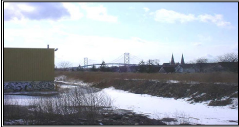
Figure 4: Existing view from Michigan Central Station