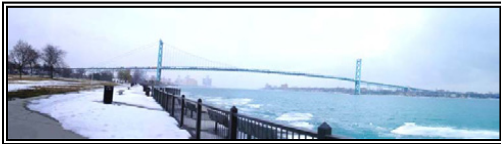
Figure 10: Existing view from Riverside Park

Figure 10 provides a panoramic view of the existing Ambassador Bridge from the Riverside Park. The aesthetically pleasing quality of the existing riverfront park and its close proximity to the bridge determine that this area has a “good” aesthetic quality. The view to the southwest (i.e. behind the viewer) is impaired by the presence of heavy industrial activity.