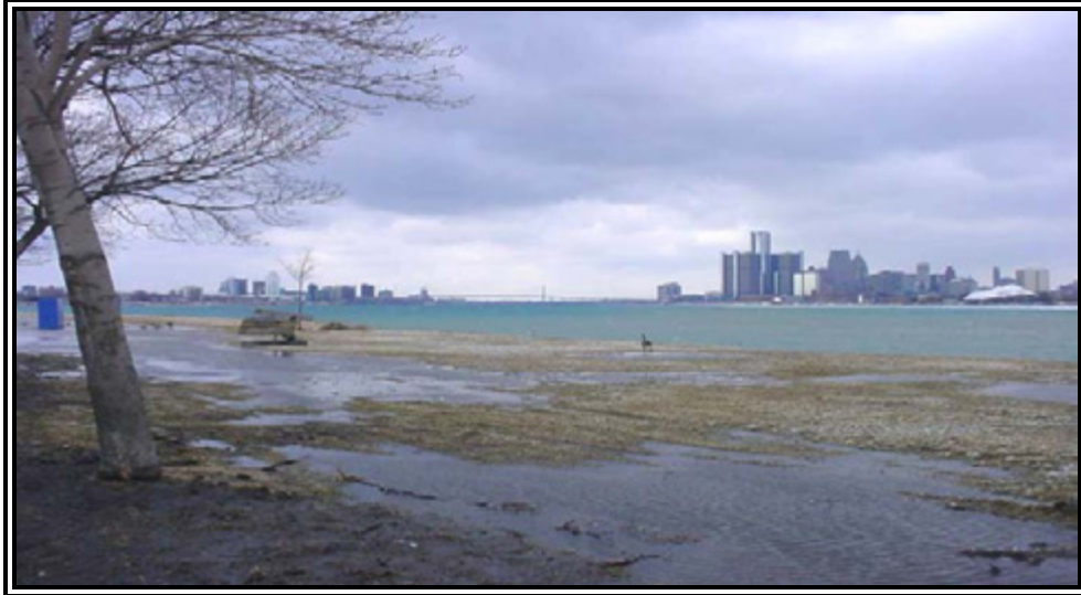
Figure 8: Existing view from Belle Isle Park