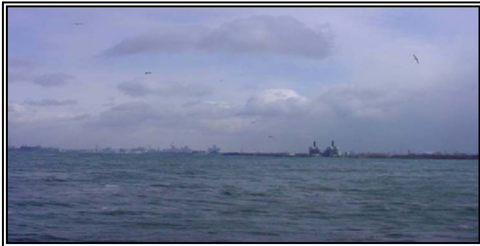
Figure 12: Existing view from Dr. Henry Belanger Park

The view from Belanger Park is at the western limit of the viewshed. Figure 12 illustrates the "moderate" aesthetic quality of this view due to a combination of both "poor" and "good" quality aesthetic features within this viewshed. This vantage point is at the outer limit of the established five-mile radius. Details of structures within the project area cannot be seen. The heavily industrialized shoreline that is present on both sides of the river looking east toward the existing bridge detracts from the aesthetic quality of this area. The quality of the view from the park contains the positive impacts of the river front, the historic elements of the Cities of Detroit and Windsor and the existing Ambassador Bridge as a symbol of the important trade relationship between the U.S. and Canada.