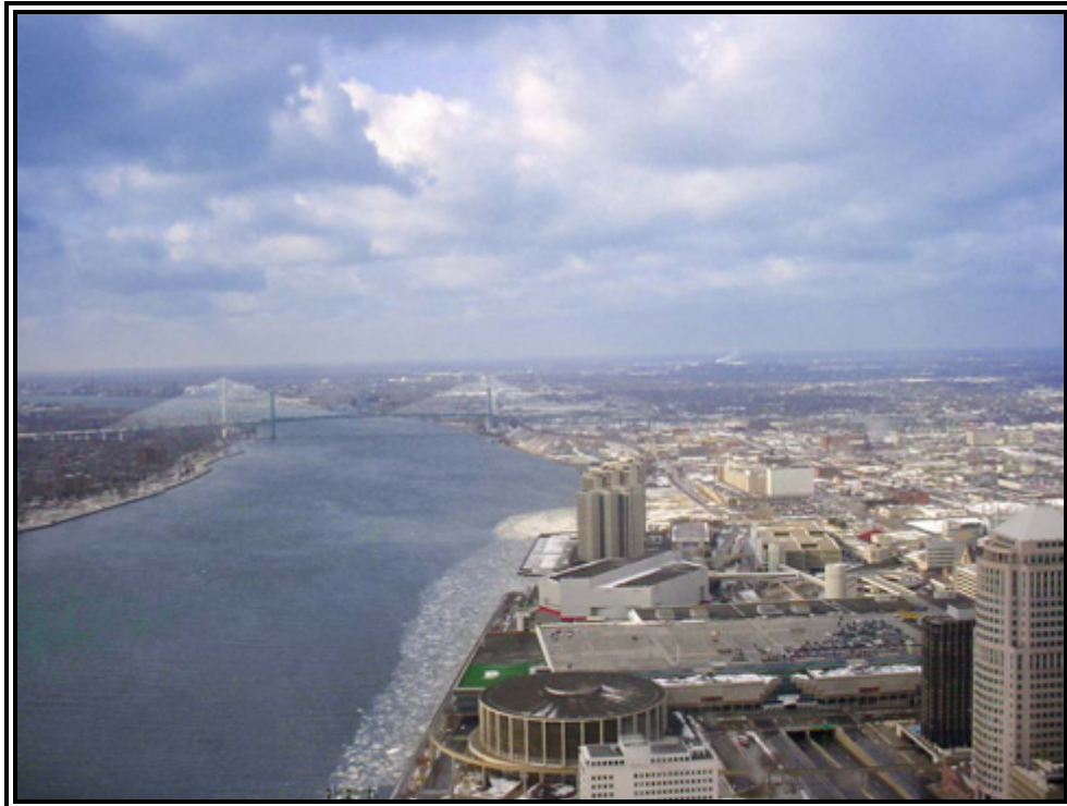
Figure 7: Simulation view of the project from the Renaissance Centre Observation Deck

located down stream, making the view more aesthetically pleasing. The quality of the view from this vantage point will continue to be categorized as “good”.