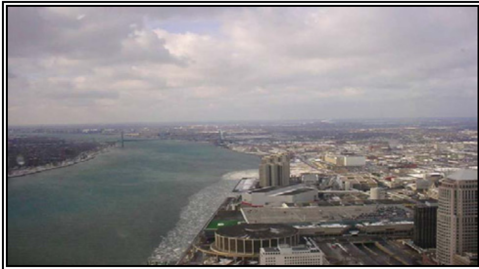
Figure 6: Existing view from the Renaissance Centre Observation Deck

The observation deck and the dining facility at the top of the centre tower provide one of the only complete panoramas of the City of Detroit. The historic layout of the city along with development and changes that have occurred in the past 200 years can be observed from this vantage point. As Figure 6 demonstrates, the observation deck also provides an uninterrupted view of the entire project area. This combined with the Aesthetic appeal of the river result in a “good” aesthetic quality. The visibility of the proposed project area would also be considered “high” given the location and prominence of the existing Ambassador Bridge. However, much of the north shore of the river south of the Ambassador Bridge is heavily industrialized and detracts from the overall aesthetic quality looking in this direction.