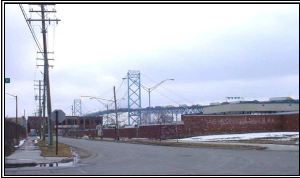
Figure 2: Existing view from St Anne’s Cathedral

with the existing customs plaza impede the view of the bridge but the visibility of the bridge remains “high” due to the cathedral’s proximity to the structure. It should be noted that proposed changes in the view shed will only be visible from the southwest corner of the St. Anne’s complex. Currently the view from the southwest corner is dominated by the existing Ambassador Bridge which is located at the base of the bridge less than a half a mile to the east.