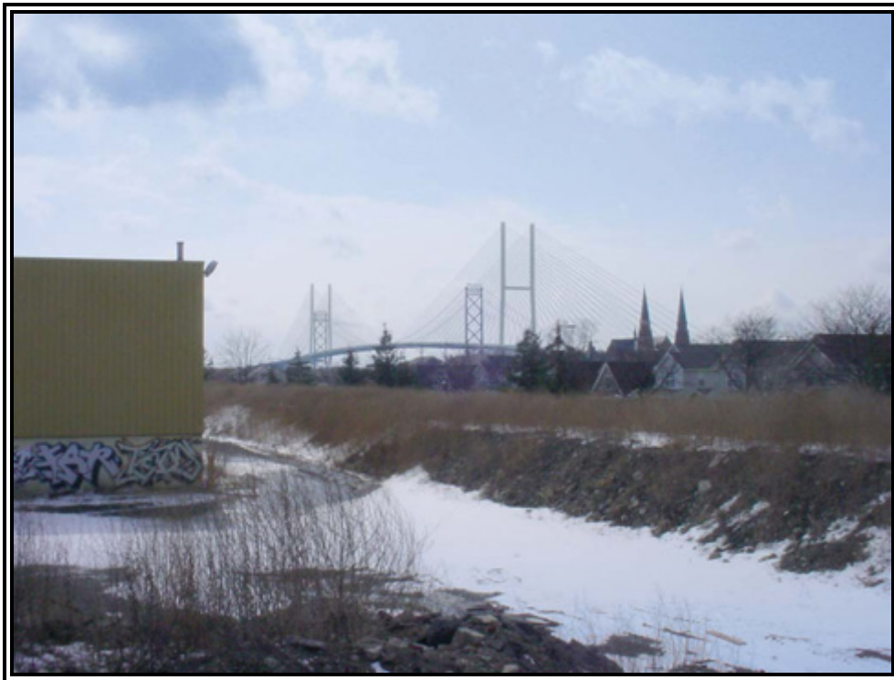
Figure 5: Simulation view of project from Michigan Central Station

The post-construction view from the station would have the same aesthetic quality previously noted. Figure 5 demonstrates that the new span would not interfere with the view of the cathedral spire or the existing bridge given the location of the new span to the west of the existing one. In fact the quality of the view would be upgraded to “good” given the grandeur of the proposed span combined with the historic presence of the existing span.